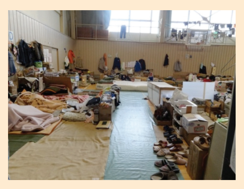
FIGURE 2: An evacuation center, one month after the earthquake

In May 2011, there were two reported cases of rape confirmed in the three affected prefectures after the disaster, compared to nine reported incidents at the same time in 2010. There were thirteen reported cases of forcible indecency compared to thirty-two cases in the previous year. The Minister of State said these incidents did not occur in the affected areas. It is difficult, however, to obtain verifiable numbers of sexual harassment incidents since they can take many forms–from sexual taunting to physical harassment–and often go unreported. At evacuation centers, personal alarms were distributed to protect women and children, and they were cautioned to avoid going to the outdoor toilets alone, especially at night.