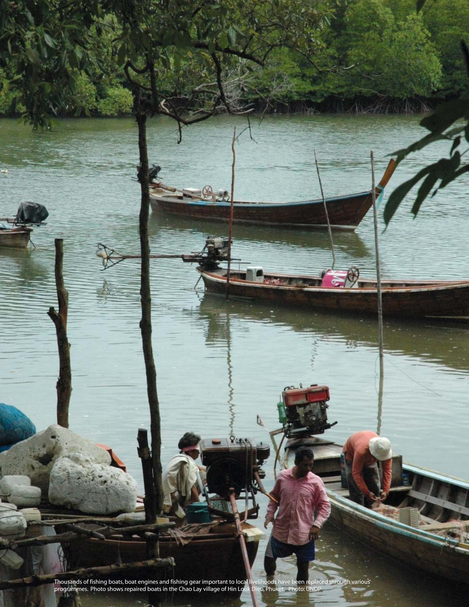
Thousands of fishing boats, boat engines and fishing gear important to local livelihoods have been replaced through various programmes. Photo shows repaired boats in the Chao Lay village of Hin Look Dieu, Phuket.