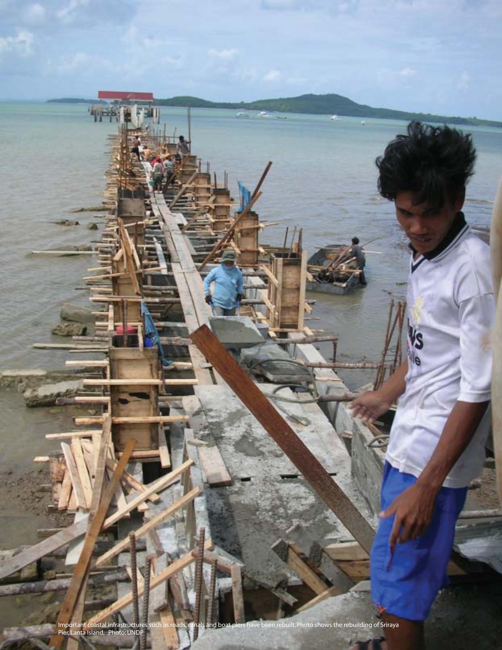
Important coastal infrastructures such as roads, canals and boat piers have been rebuilt. Photo shows the rebuilding of Sriraya Pier, Lanta Island.