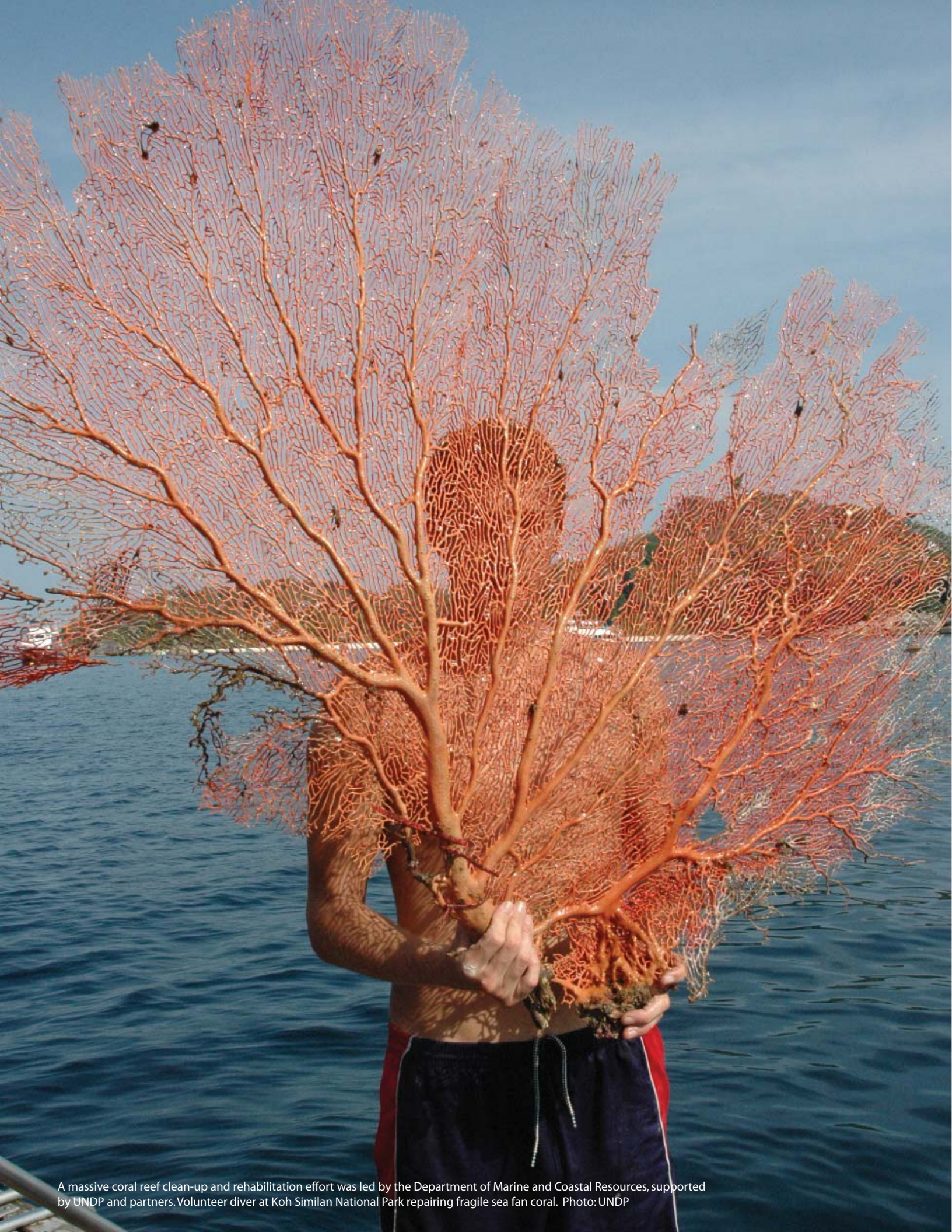
A massive coral reef clean-up and rehabilitation effort was led by the Department of Marine and Coastal Resources, supported by UNDP and partners. Volunteer diver at Koh Similan National Park repairing fragile sea fan coral.