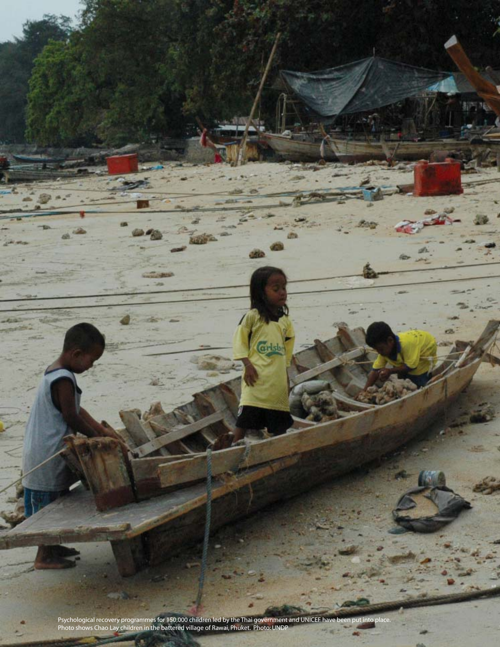
Psychological recovery programmes for 150,000 children led by the Thai government and UNICEF have been put into place. Photo shows Chao Lay children in the battered village of Rawai, Phuket.