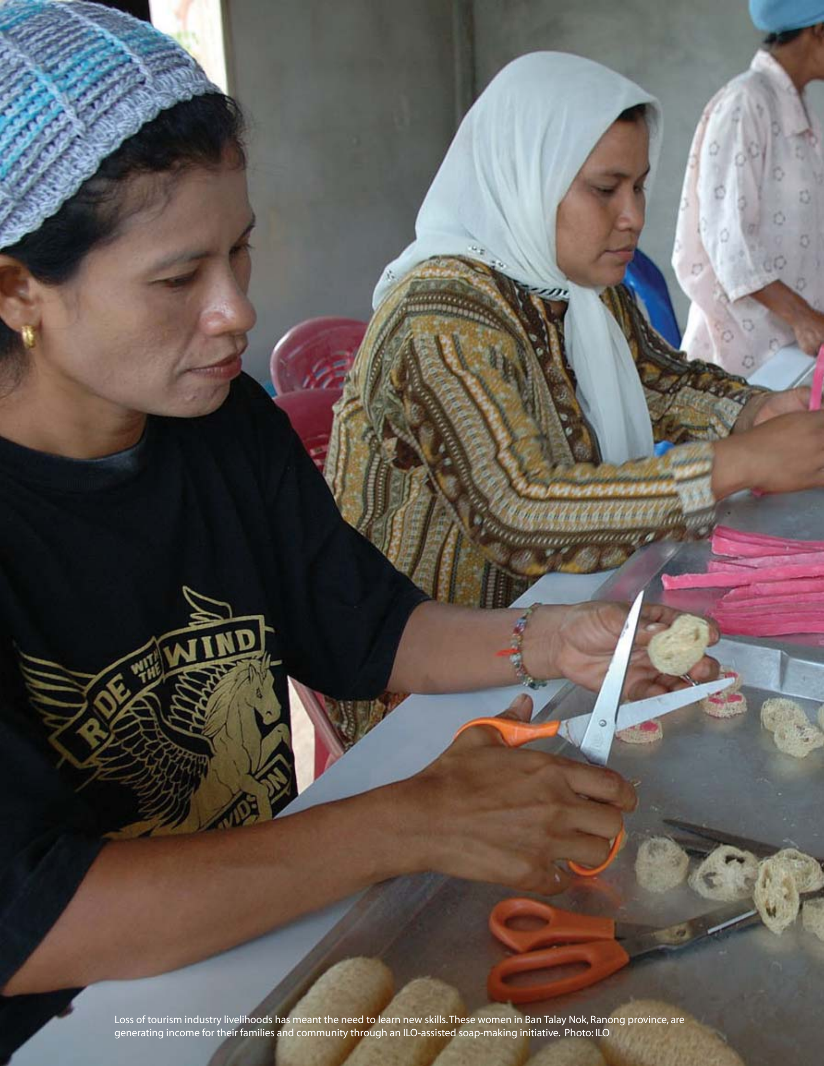
Loss of tourism industry livelihoods has meant the need to learn new skills. These women in Ban Talay Nok, Ranong province, are generating income for their families and community through an ILO-assisted soap-making initiative.