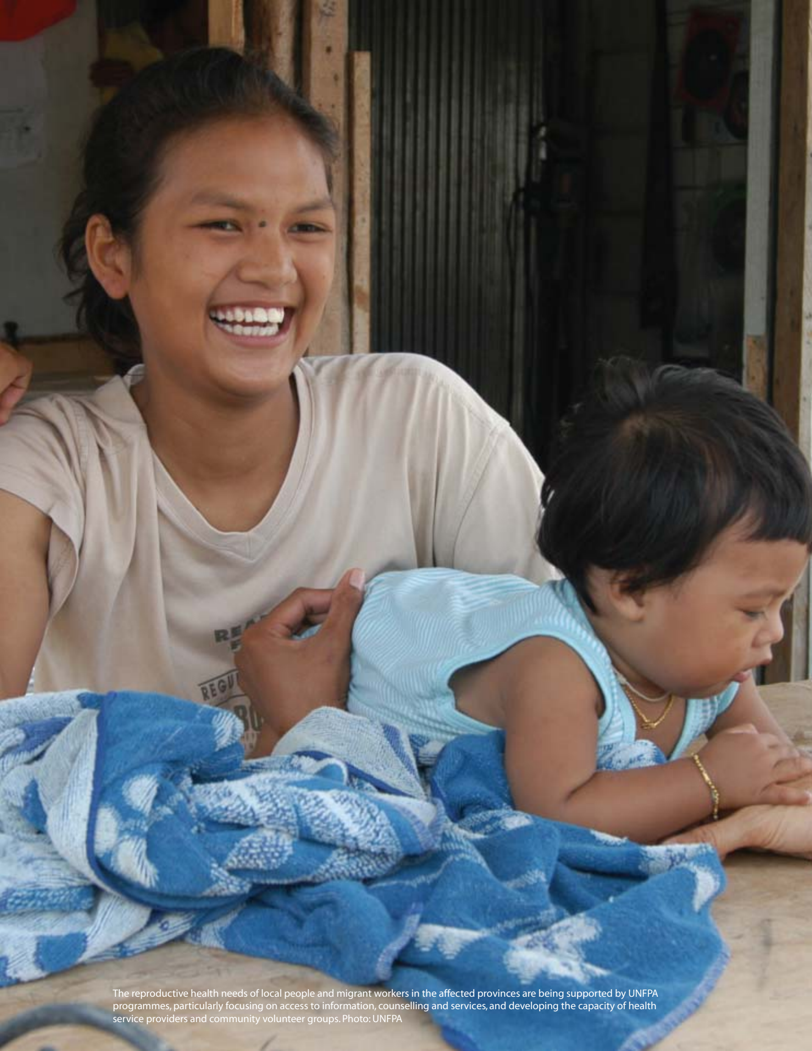
The reproductive health needs of local people and migrant workers in the affected provinces are being supported by UNFPA programmes, particularly focusing on access to information, counselling and services, and developing the capacity of health service providers and community volunteer groups.