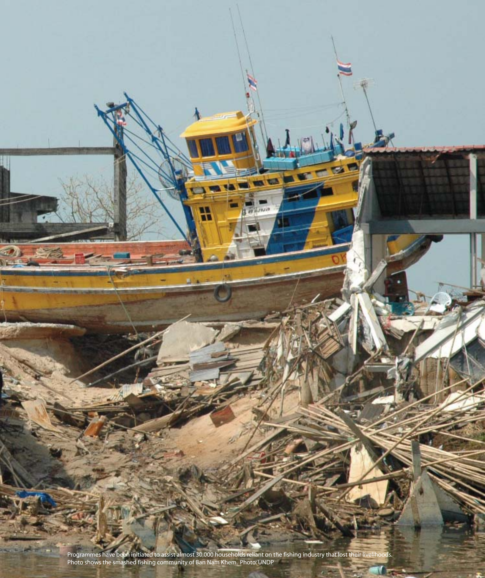
Programmes have been initiated to assist almost 30,000 households reliant on the fishing industry that lost their livelihoods. Photo shows the smashed fishing community of Ban Nam Khem.