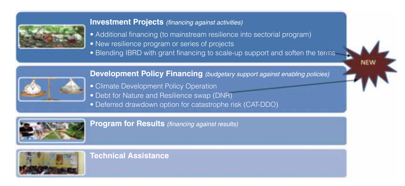
FIGURE 3 Financing Instruments under SISRI

Funding can be in parallel, where several legal agreements are signed in support of a common operation, or blended—such as a donor-funded Trust Fund grant, combined with a loan from the International Bank for Reconstruction and Development (IBRD.) this has the advantages of softening the terms for highly indebted Small Island States, and can potentially increase the financing available to low and middle income countries beyond what they would have been able to access through their country envelopes.