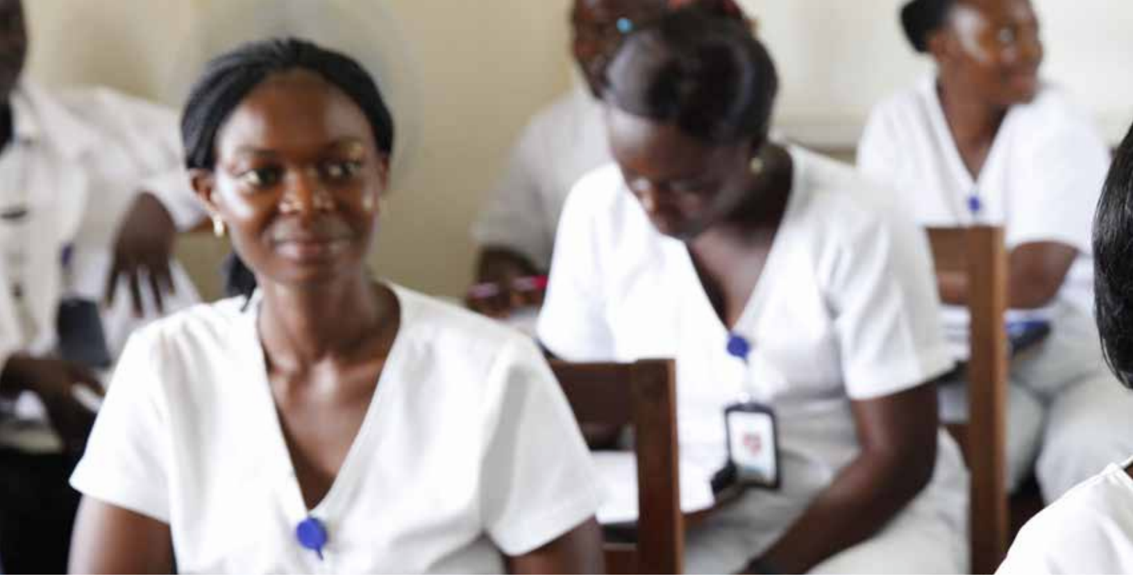
Nurses listen during a training program to learn more about child and adolescent mental health in Monrovia, Liberia.