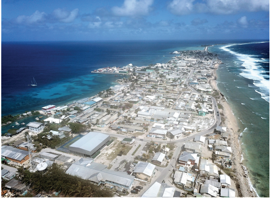
Ebeye island at Kwajalein Atoll, Republic of Marshall Islands.

East Asia and the Pacific (EAP) is one of the world's most disasterprone regions, bearing the impacts of nearly 70 percent of natural hazard events globally and affecting more than 1.6 billion people in the past 20 years.