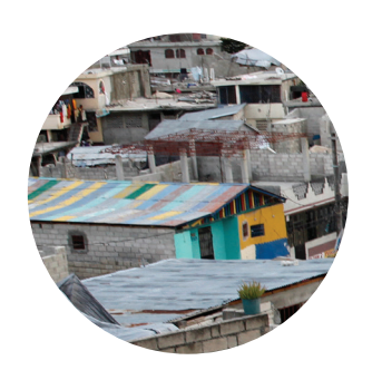
$50 billion to $200 billion increase in average annual weather-related losses & damages alone since the 1980s.

Supporting countries to manage the cost of disaster and climate shocks