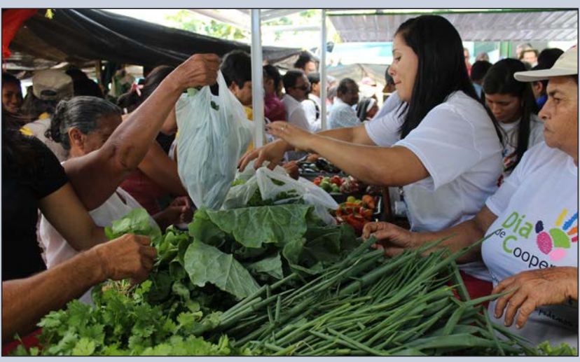
Members of cooperatives selling their produce.