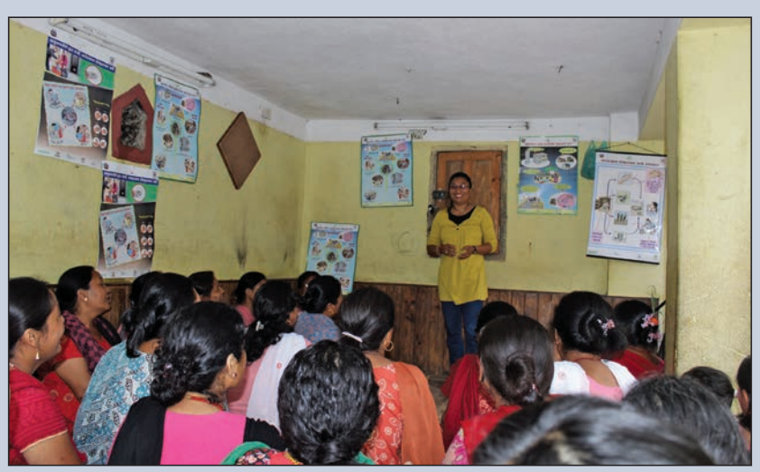
Lumati Support Group for Shelter in Katmandu.