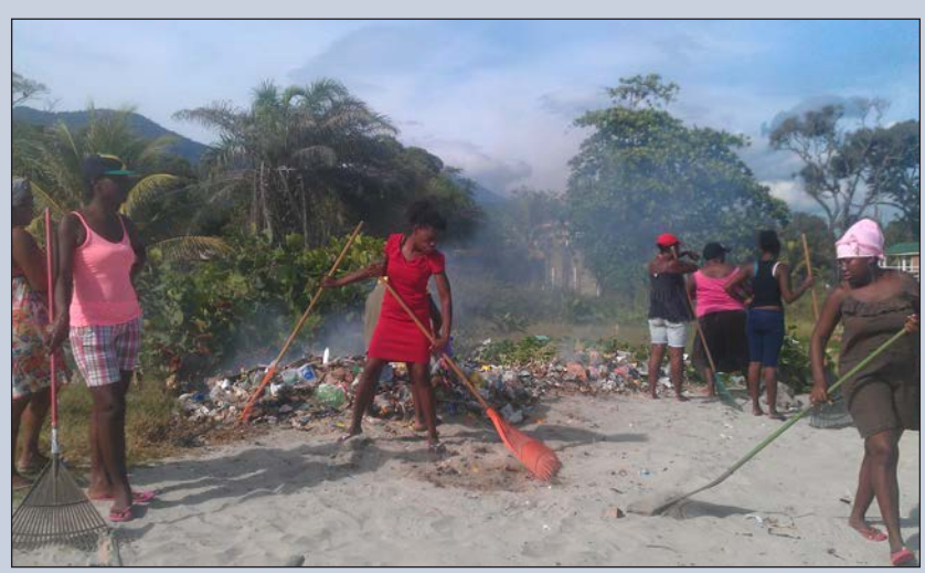
Members of WAGUCHA participate in a beach cleaning in the community of Corozol, Atlantida.