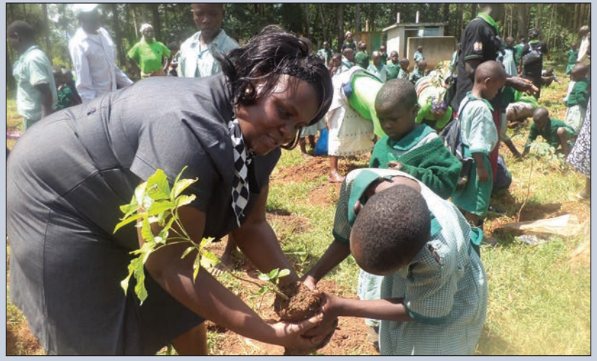
School tree planting program.