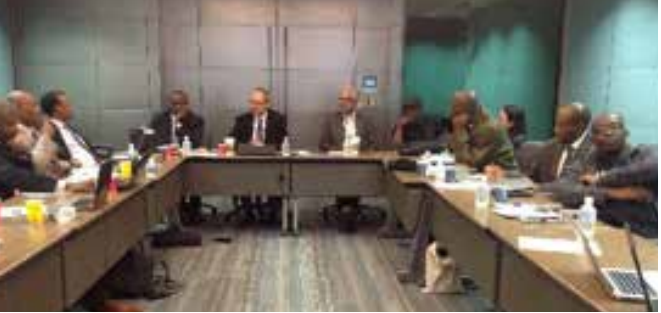
Left: ACP DRR focal points meeting in the margins of the 3<sup>rd</sup> WCDRR held in Sendai, Japan, in March 2015. Source: GFDRR

Right: African RECs meeting in Tokyo to exchange on work plans, in March 2015. Source: GFDRR