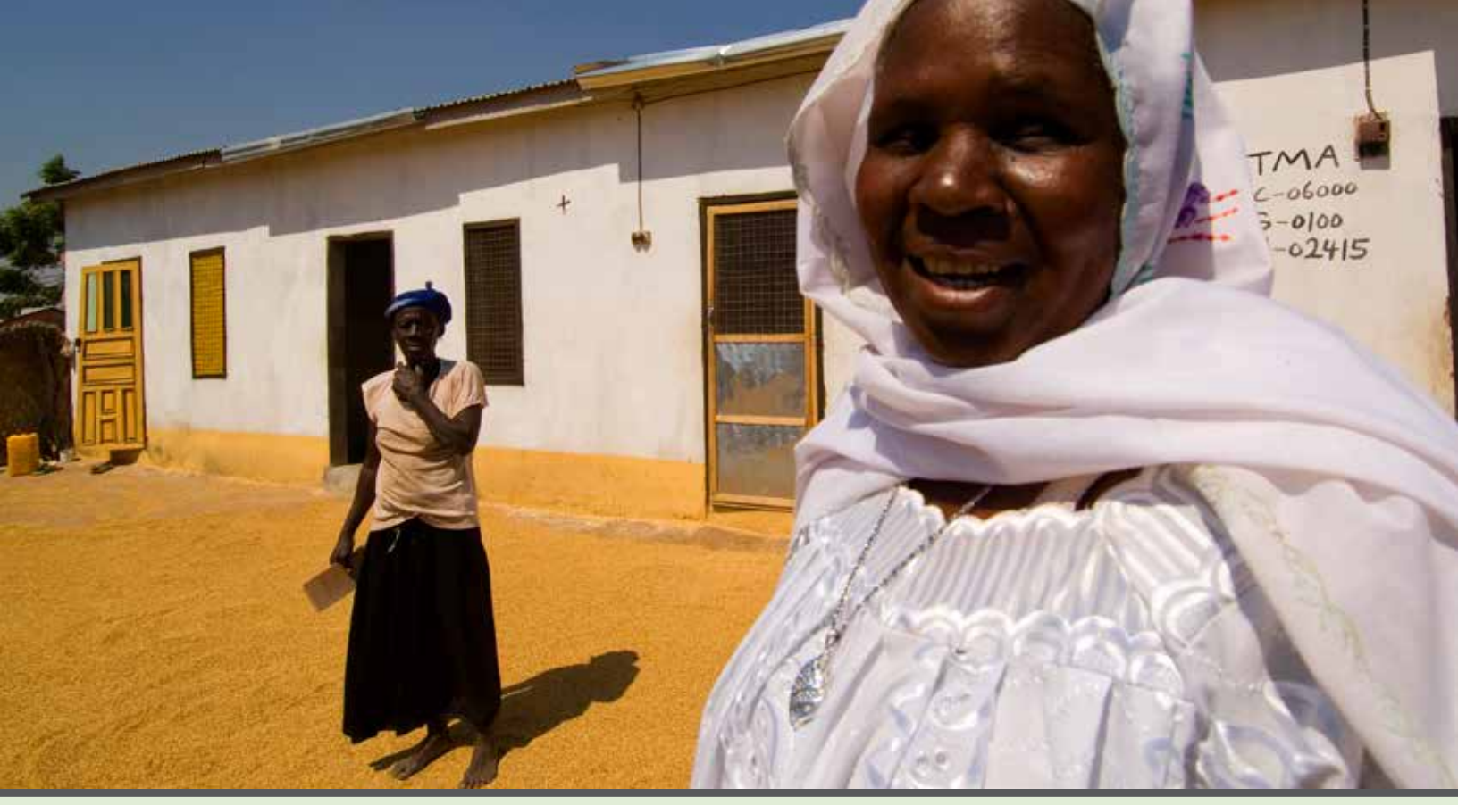
Above: A small business owner. Ghana.