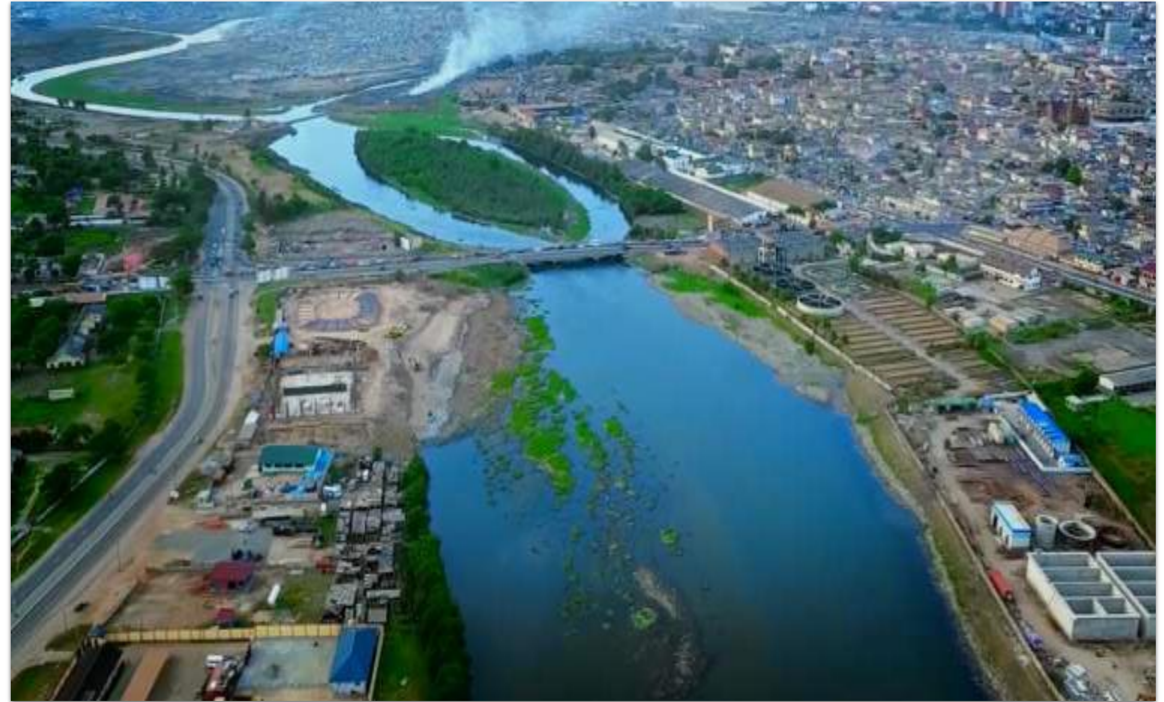
Odaw River Basin