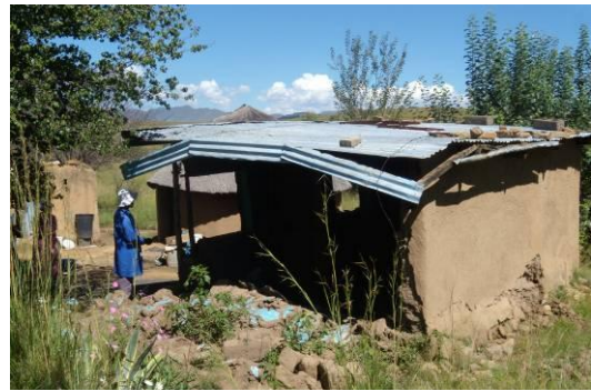
Figure 1: Damaged house by severe weather events

A series of severe weather events hit Lesotho between December 2010 and February 2011, with consequent river floods, run-off from hill slopes and rockslides. For 40 days since the end of December 2010, rainfall measures in the northern districts of the country was equivalent to six months of rainfall under normal conditions. The rest of the country received 50% of normal rainfall for six months. The accumulated rainfall of December 2010 and January 2011 the highest recorded since 1933 recorded in the lowlands. Additionally, strong winds and localized hailstorms caused severe damages. As initially rains started late and remained below average until November, the impact on the agricultural sector was substantial. The Lesotho Vulnerability Assessment Committee therefore estimated that some 250,000 people – or 13.6 % of the total population - were affected by the events; among those affected over 3360 were displaced.