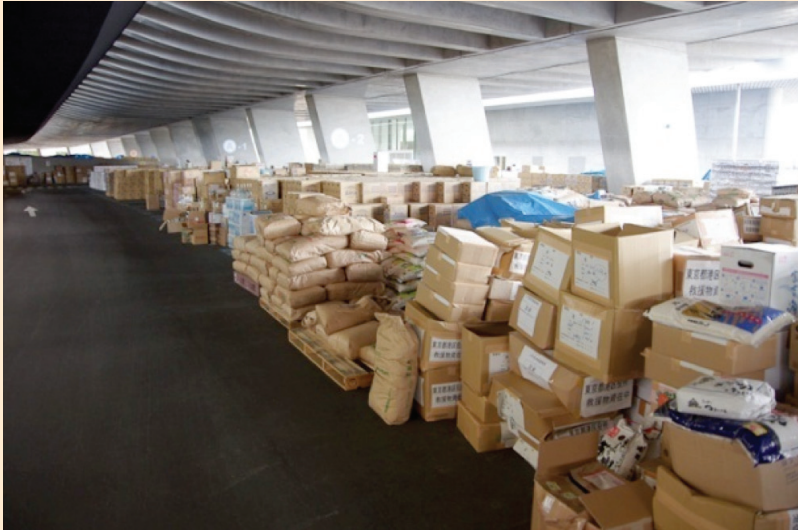
FIGURE 3: Badly organized inventory in an initially assigned depot (Iwaki Civic Hall, March 23, 2012)