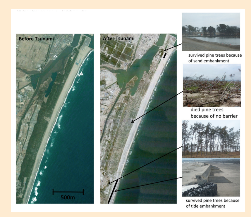
FIGURE 3: Condition of the green belt before and after the tsunami in Natori City