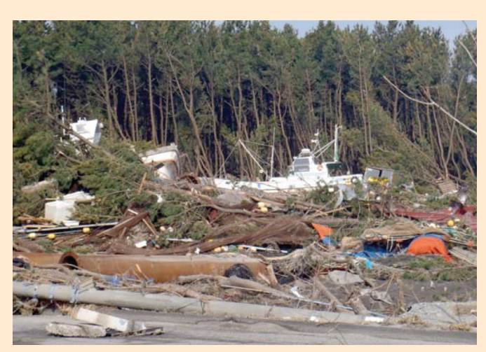
FIGURE 2: The forest captures a floating ship