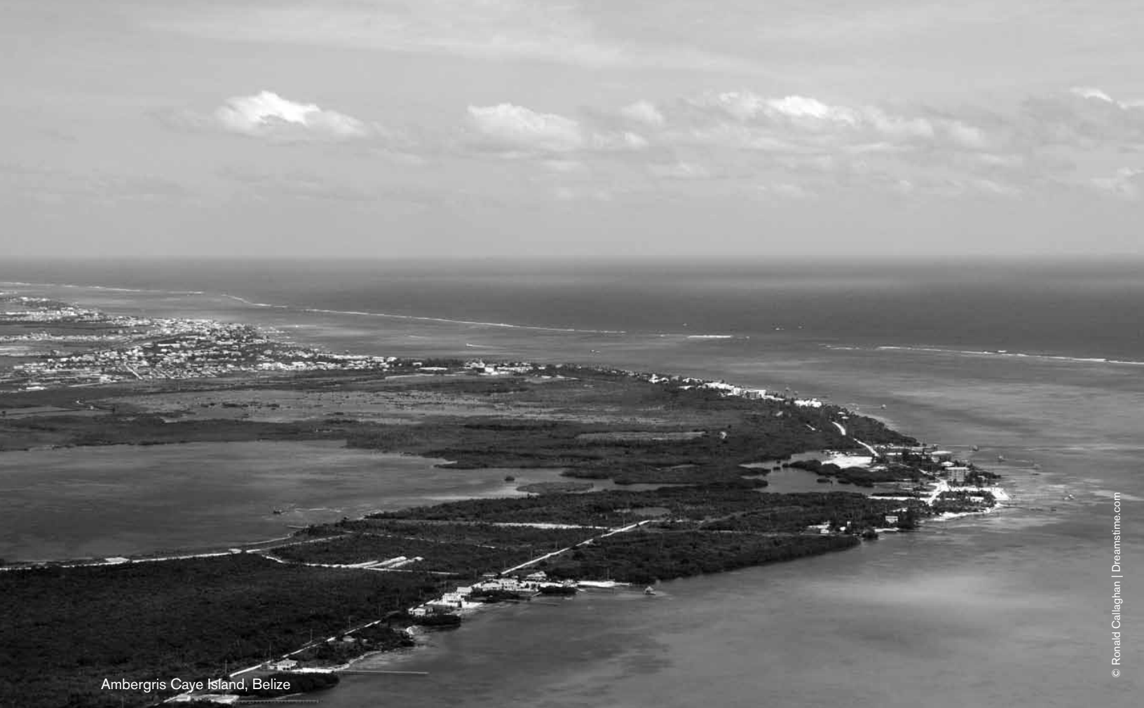
Ambergris Caye Island, Belize