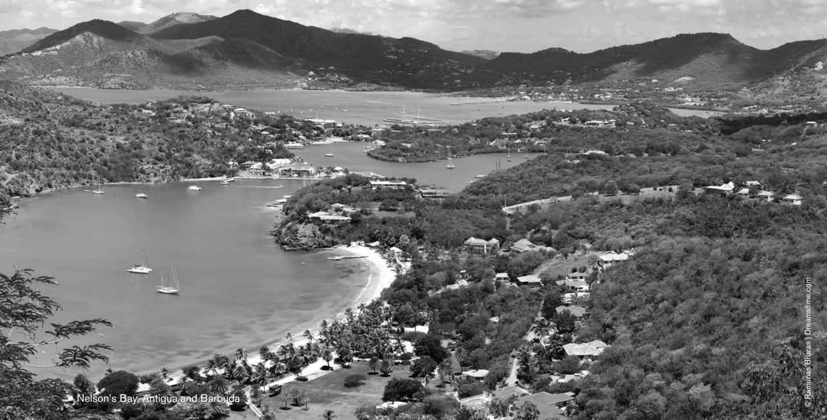
Nelson's Bay, Antigua and Barbuda