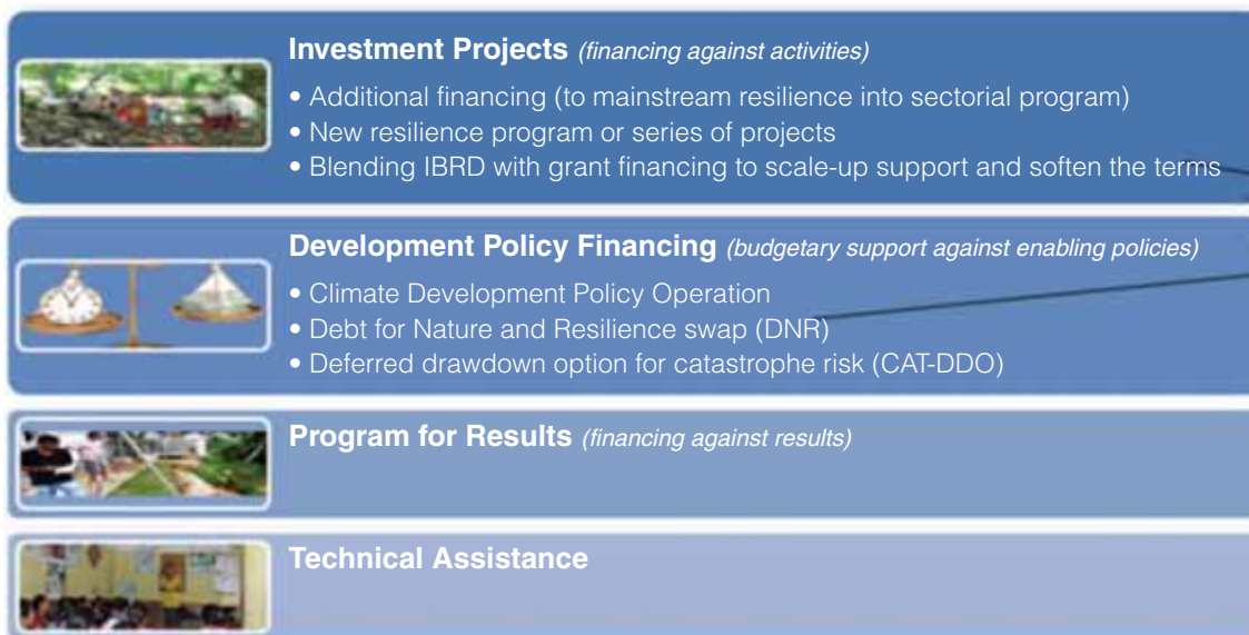
FIGURE 3 Financing Instruments under SISRI

Funding can be in parallel, where several legal agreements are signed in support of a common operation, or blended—such as a donor-funded Trust Fund grant, combined with a loan from the International Bank for Reconstruction and Development (IBRD.) this has the advantages of softening the terms for highly indebted Small Island States, and can potentially increase the financing available to low and middle income countries beyond what they would have been able to access through their country envelopes.