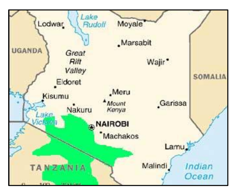
Green area shows Maasai regions in Kenya and Tanzania

•In Beirut, women are reaching out to displaced Iraqi women and have helped increase engagement with urban refugee populations.