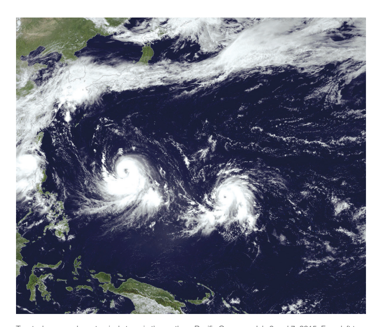
Two typhoons and one tropical storm in the northern Pacific Ocean on July 6 and 7, 2015. From left to right: Tropical Storm Linfa is in the South China Sea. Typhoon Chan-Hom is heading west-northwest toward the East China Sea. Typhoon Nangka is making its way east of Guam.

(6) Link with disaster risk management agenda. Disaster risk financing is part of the broader disaster risk management agenda, which aims to mitigate/reduce the disaster risks faced by the PICs. The PCRAFI Program is executed in partnership with the Secretariat of the Pacific Community (SPC) who holds the regional mandate for disaster risk management. Disaster risk management plans have been developed by each PIC under the Hyogo framework and now the Sendai framework.