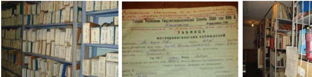
Figure 2.5. Data Archive in Kyrgyzhydromet Central Office and Data Records from Observation Sites