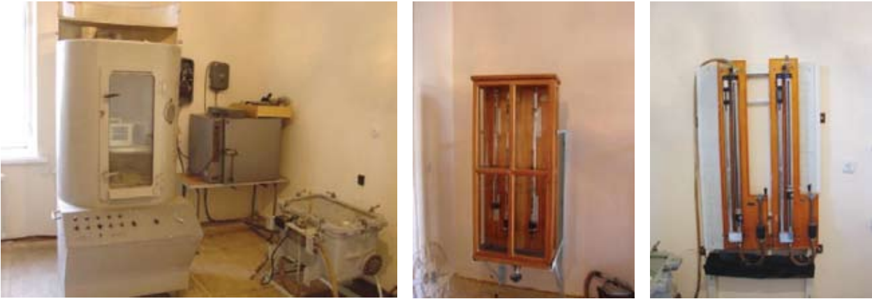
Figure 2.2. Checking and Calibrating Instruments and Facilities in Central Office of Turkmenhydromet

In addition, nearly all of the means of forecasting and producing information fail to meet modern requirements for hydrometeorological services provided to public authorities, the economy, and communities. Without adequate means of production, the capacity to provide services to users is very limited. Overall forecasts have relatively low skill compared with NMSs outside of the CIS region.