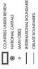
Figure 1.1. Map of Central Asia