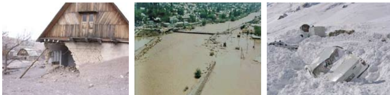
Figure 1. Mudflow, Flood, and Avalanche Related Damage in Kyrgyz Republic