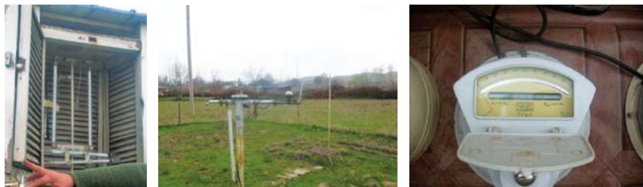
Figure 2.1. On-site Meteorological Equipment and Instruments (Tajikistan, 2008)

Extensive technical reviews have been conducted of observational networks and other hydrometeorological infrastructure (telecommunications, facilities for forecasting weather conditions for each country, warning systems) and of the region's hydrometeorological services, including the outcomes of assistance projects implemented by the donors in support of regional NMHSs. The reviews show that current conditions of the hydrometeorological services fail to meet the hydrometeorological services needs of either their respective governments or the weather and climate-sensitive social and economic sectors. They also show that the NMS in each of the three countries reviewed fails to fulfill the country's regional and international obligations for weather and climate information, including those under the World Meteorological Organization's Global Observation Network.