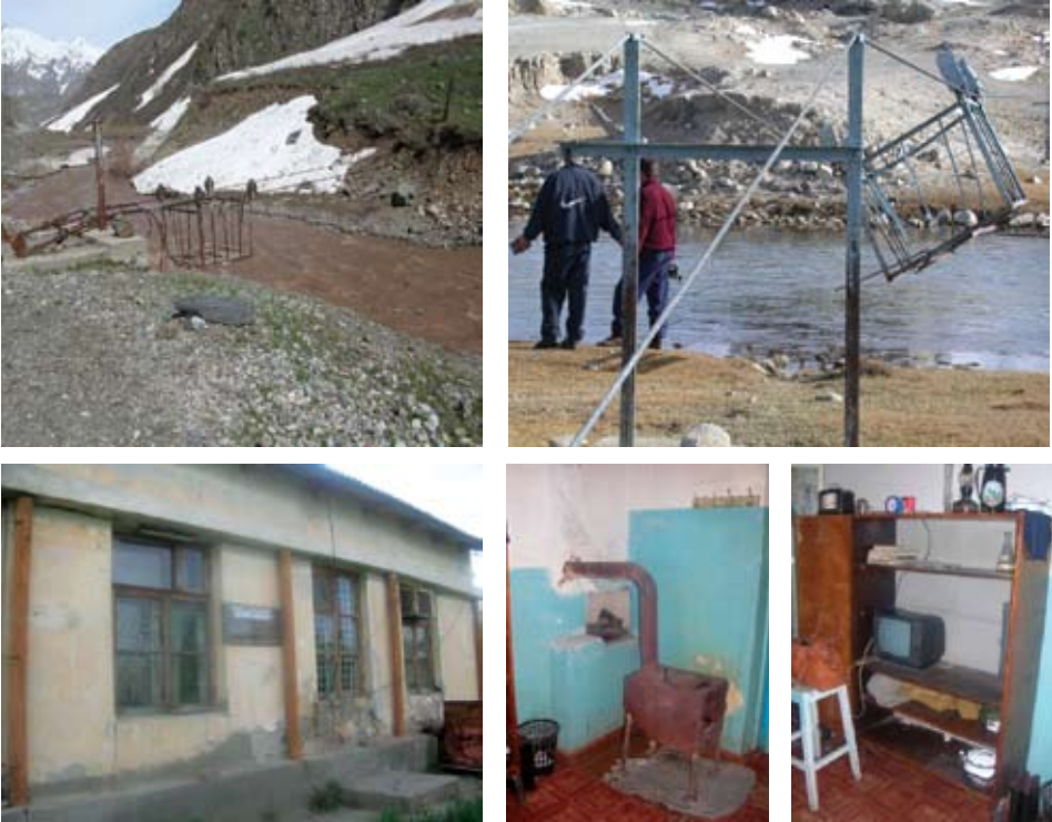
Figure 2.3. Hydrological and Meteorological Stations Buildings and Facilities in the Republic of Tajikistan