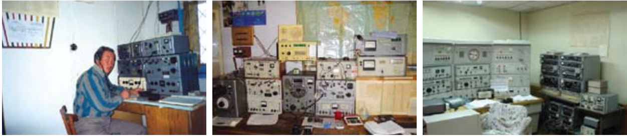
Figure 2.4. Current Communication and Data Transmission Equipment at Meteorological Station (photo 1 and 2 – Kyrgyz Republic), and Message Switching Center (photo 3 – Central Office of Turkmenhydromet)