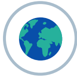
Global Knowledge & Good Practices