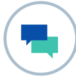
Policy Dialogue and Reform