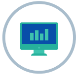
Tools & Analysis